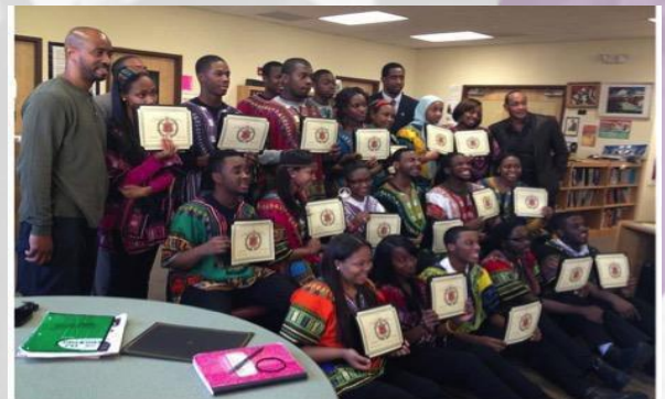
Omega Psi Phi high school Essay Contest