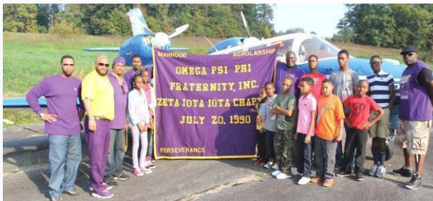
Young Eagle girls and boys (aspiring aviators)