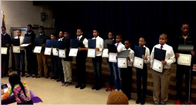
Youth recognition for academic achievement