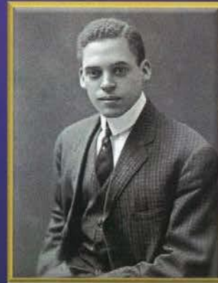
DR. ERNEST E. JUST