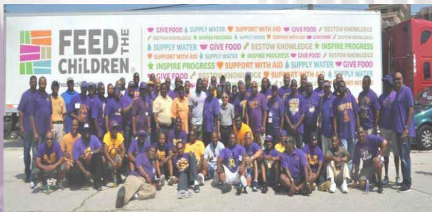
Partnership to fight hunger