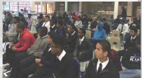
Omega Leadership Conference for young males