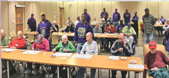
Veteran's Day Bingo at Armed Forces Retirement Home