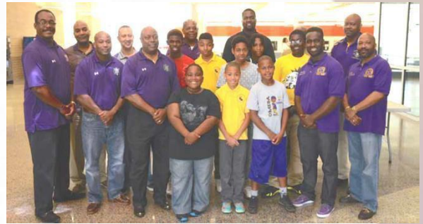
Science, Technology, Engineering & Math (STEM) Program