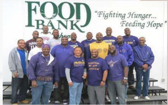
Partnerships to fight hunger