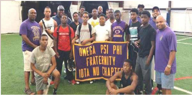
Youth football camp