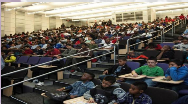
Game Changer Youth Conference for young males