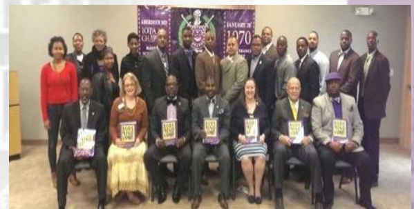
Supporting literacy through book donations