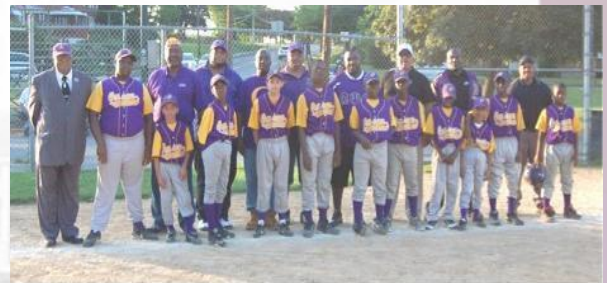
Youth baseball team